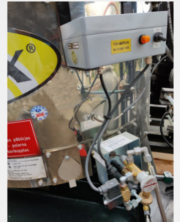
Electronic starting system and FeCuNi temperature sensor