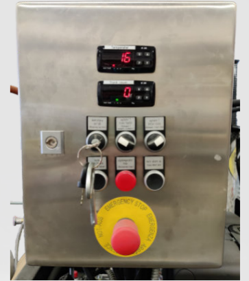
Electronic system control and thermostat