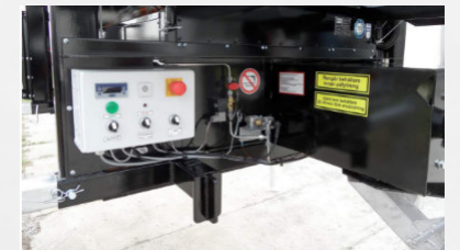
Heating system with timer function