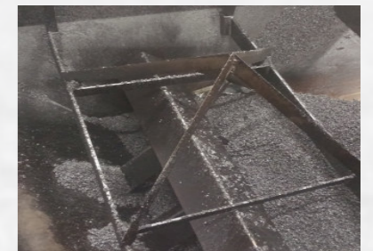
Allround heating & bag discharge knife