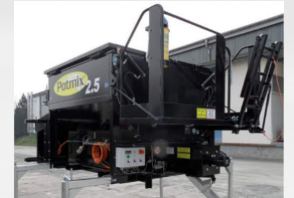
Standing platform & external gas burner