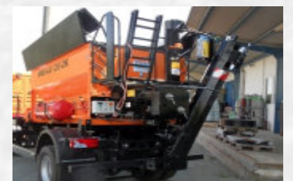
Additional external auger