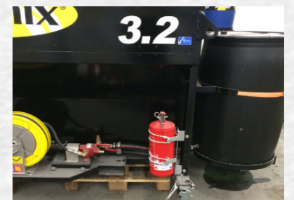
Emulsion tank & pump