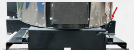
Fork lift insertions for easy lifting